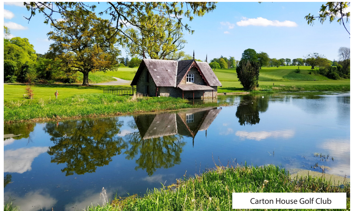
Carton House Golf Club