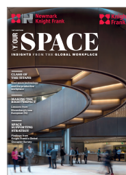
(Y)our Space 2018

Knight Frank Research Reports are available at KnightFrank.com/Research