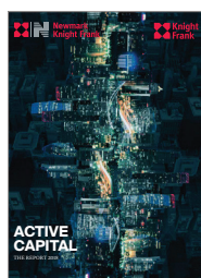
Active Capital – The Report 2018