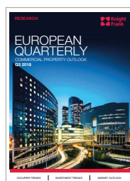
European Quarterly - Q3 2018