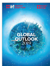
Global Outlook 2019